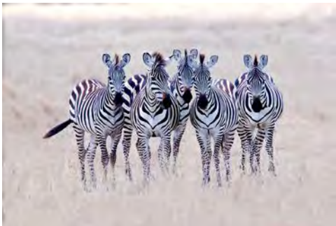
Zebra Girls – Jim Irwin